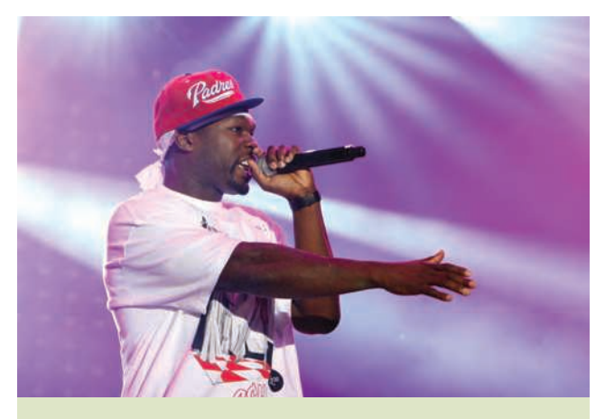
50 CENT PERFORMING IN 2009

The closest thing to a nineteenth-century-style melodic element is a single slowly rising scale fragment produced by a synthesized French horn.